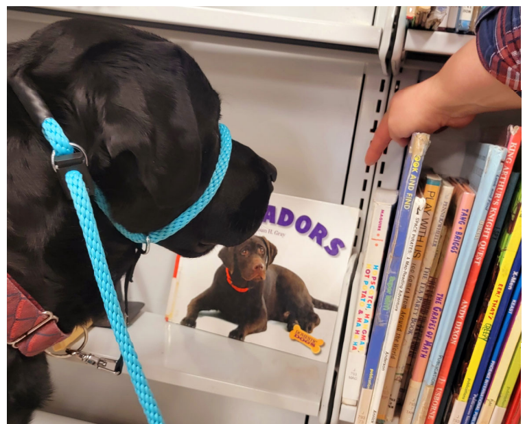
Charlie the therapy dog inspecting the library's collection of books on Labradors at our recent Storytime Explorers—he approves!

LEBANON COMMUNITY LIBRARY 125 N. 7th St. Lebanon, PA 17046 717-273-7624 lebanon.lclibs.org