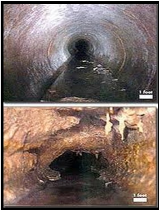
Bottom View: Actual photo by remote control camera of a grease clogged sewer pipe