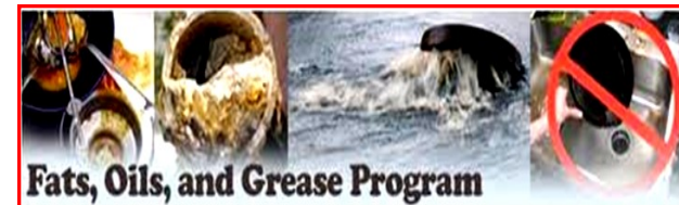
Fats, Oils, and Grease Program

Commercial & Residential FOG Information Brochure