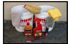
Wash vehicles with environmentally friendly cleaners.