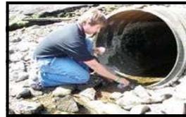
Stormwater Quality Testing