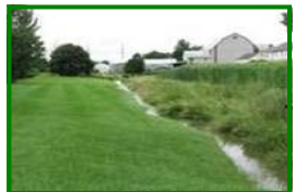
Riparian Buffers : Natural vegetation between farm fields and waterways help filter and reduce the surface runoff of dirt, fertilizers, and herbicides from entering the adjacent streams.