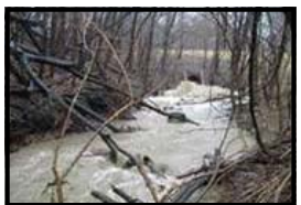
Stream Maintenance: Property owners of waterways must maintain the woody vegetation and debris along the stream to reduce damming of downstream bridges and flooding. Please keep the streams clear of fallen trees and other debris.