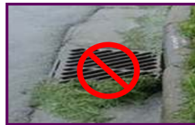
Grass clippings, leaves, and other vegetation placed in the streets is washed into storm inlet grates, which can block pipes, and causes an increase in the nitrate levels in the Chesapeake Bay.