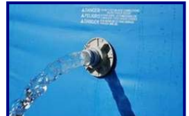
De-chlorinate Pool water & drain onto lawns and planters.