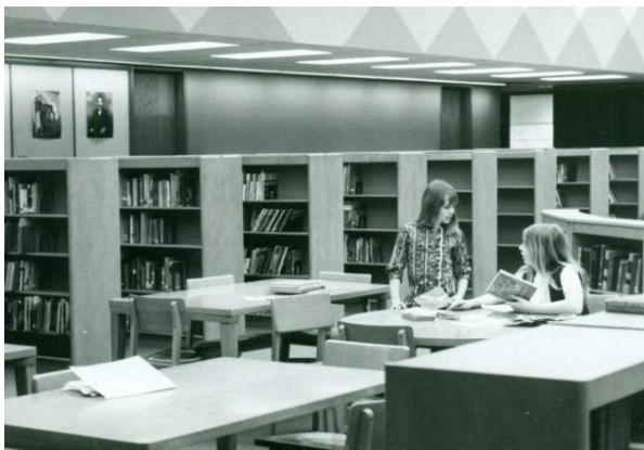
The Cedar Crest Middle School library stacks and student work area with the curved wall around the pit visible in the back right side of the photo.